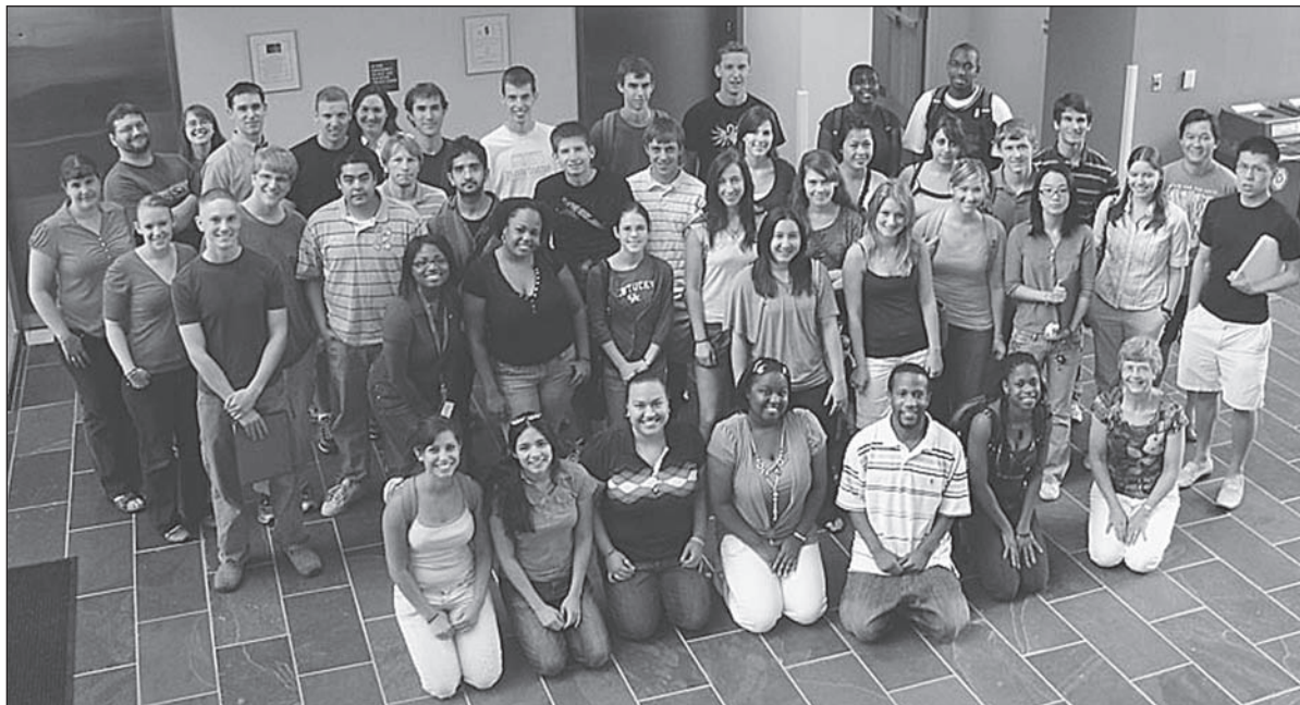
Participants in the 2009 NC State REU in Mathematics (shown in the main lobby of the new mathematics/statistics building, SAS Hall).

supporters now, because they see the programs really make a difference.”